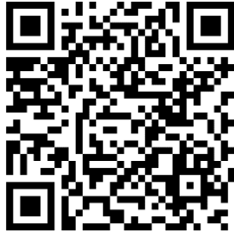
GPX - KML track